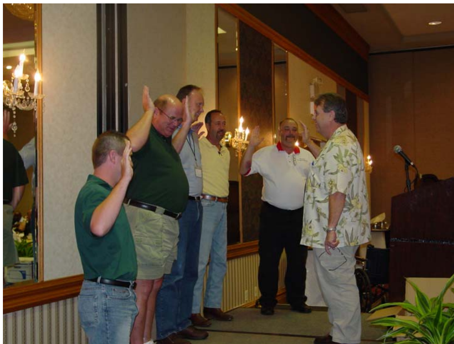
2007 Officers sworn-in