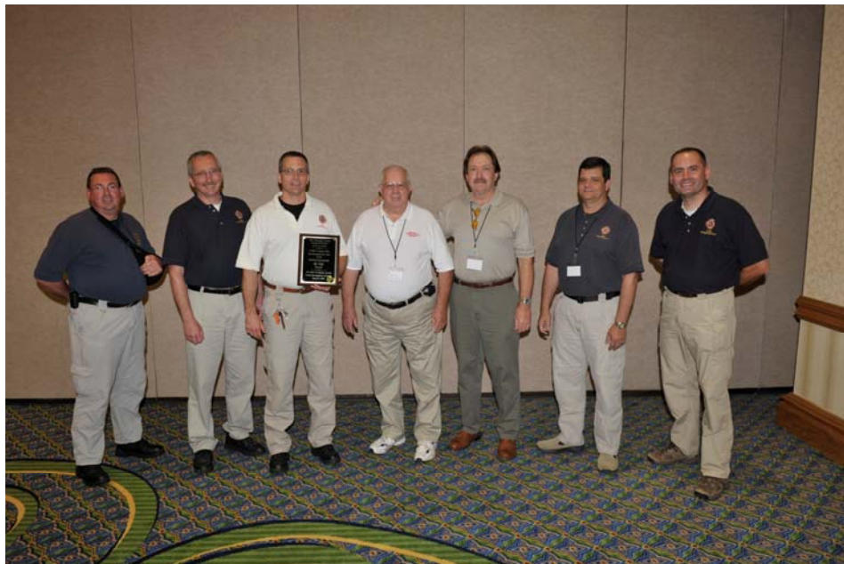
The Arson Control Board presented the Cobb County Fire Investigations Unit with the Fire Investigator of the Year Award.