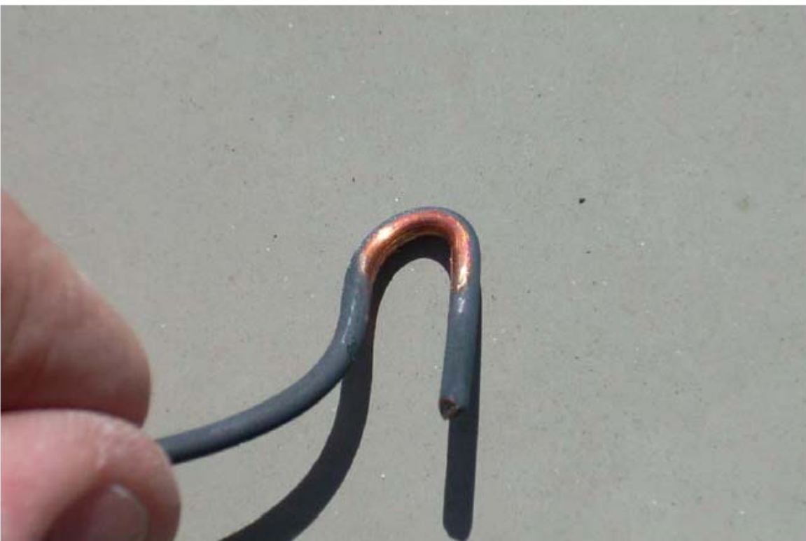
The area protected by the terminal screw shows the oxide contrasted with the natural color of copper