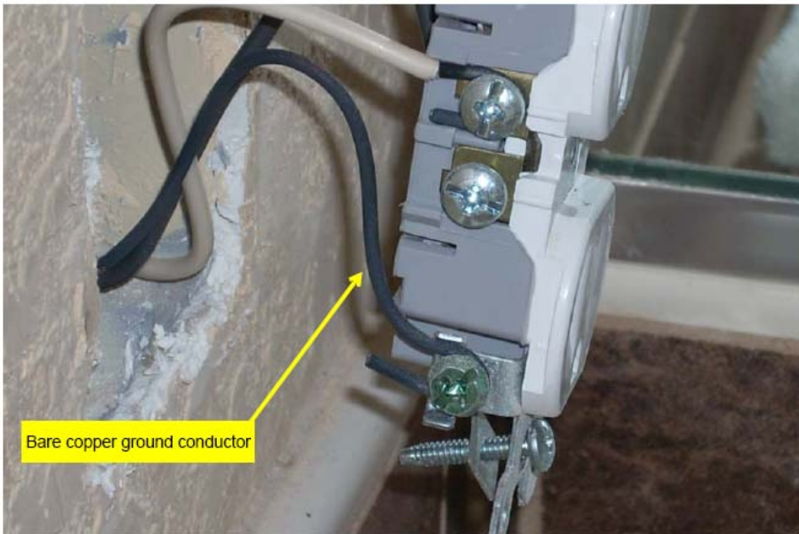
The bare copper ground conductor shows a heavy oxide coating